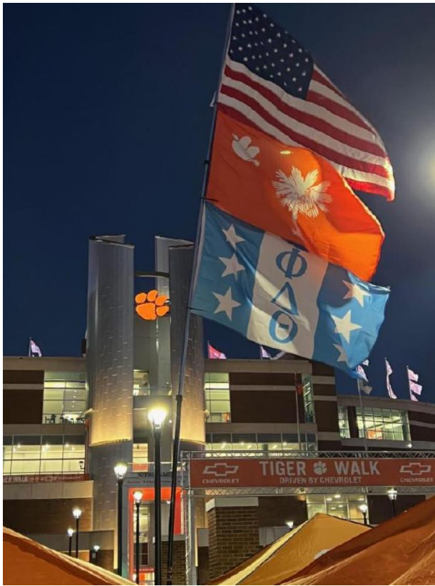
No explanation necessary.