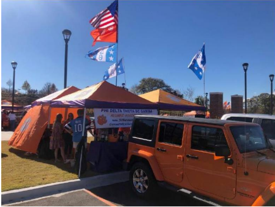
Tailgate on Tiger Walk.